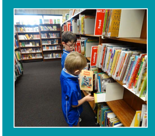
Students from Room 2 were excited to learn about and borrow Non Fiction books during their recent visit to the library.